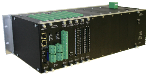
Power UMAC Controlling 8 Axes and I/O

Delta Tau Data Systems is the technology leader in high-performance machine control products. By developing and manufacturing a full range of digital signal processor-based motion control products and accessories, Delta Tau delivers motion control solutions that solve from the simplest to the most complex positioning applications. Products are marketed through a worldwide distribution network. Application engineers are located globally to provide competent and timely customer support. Delta Tau Data Systems, 21314 Lassen Street, Chatsworth, CA 91311, PH: (818) 998-2095, FX: (818) 998-7807, e-mail: sales@deltatau.com .